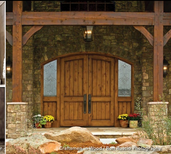
Craftsmen in Wood