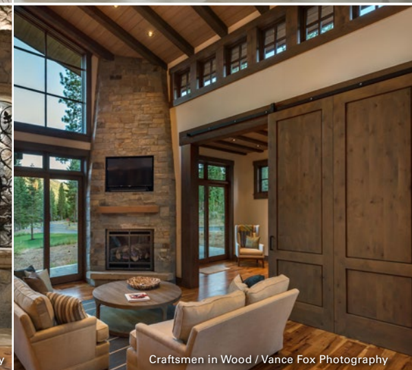
Craftsmen in Wood