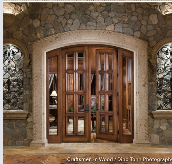
Craftsmen in Wood