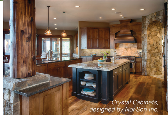
Crystal Cabinets, designed by Nor-Son Inc.

Flatter and Straighter: Alder reduces the risk of warping, ensuring consistent quality and less waste.