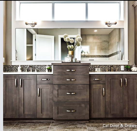
Cal Door &amp; Drawer

Additional proprietary grades available.