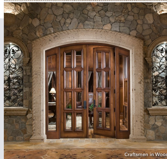
Craftsmen in Wood