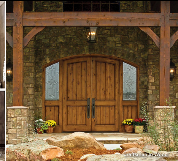
Craftsmen in Wood