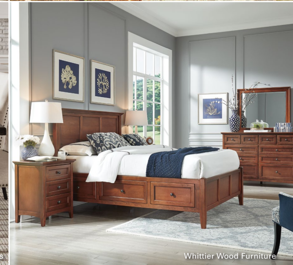
Whittier Wood Furniture