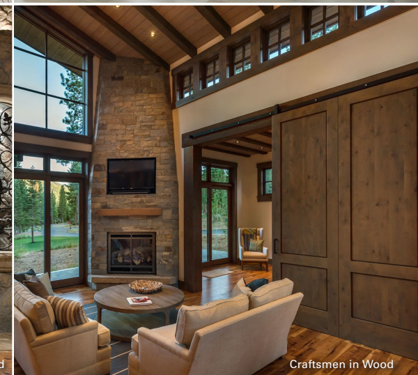
Craftsmen in Wood